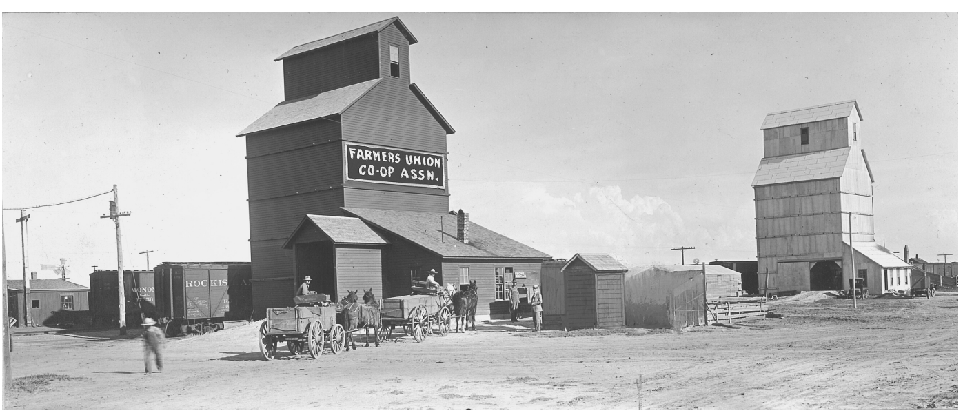
"Building Rural Communities Since 1913"