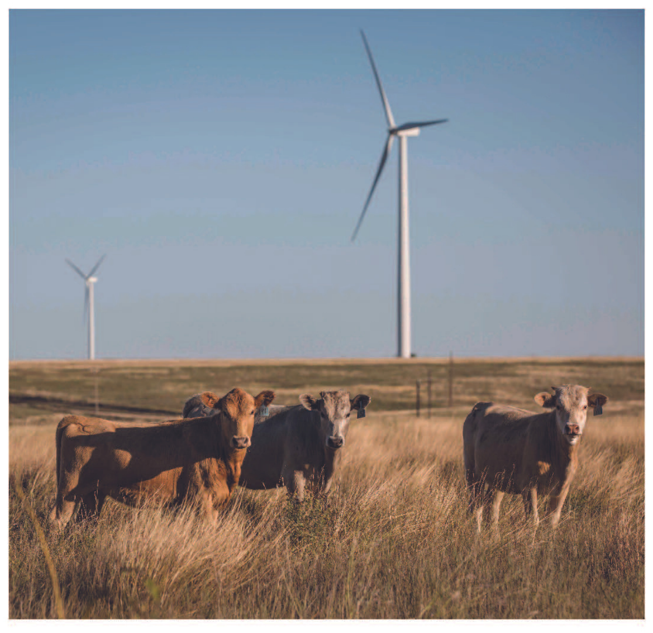
Over 800 megawatts of operating wind power in Nebraska.